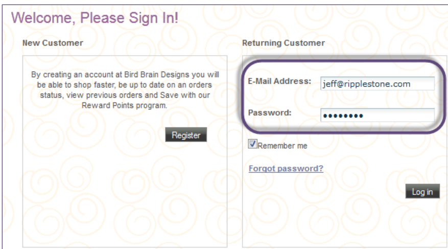
Figure 2 – Sign In Page

Clicking this link will take you to the Sign In page. From here you enter your email address and password and click the Log in button.