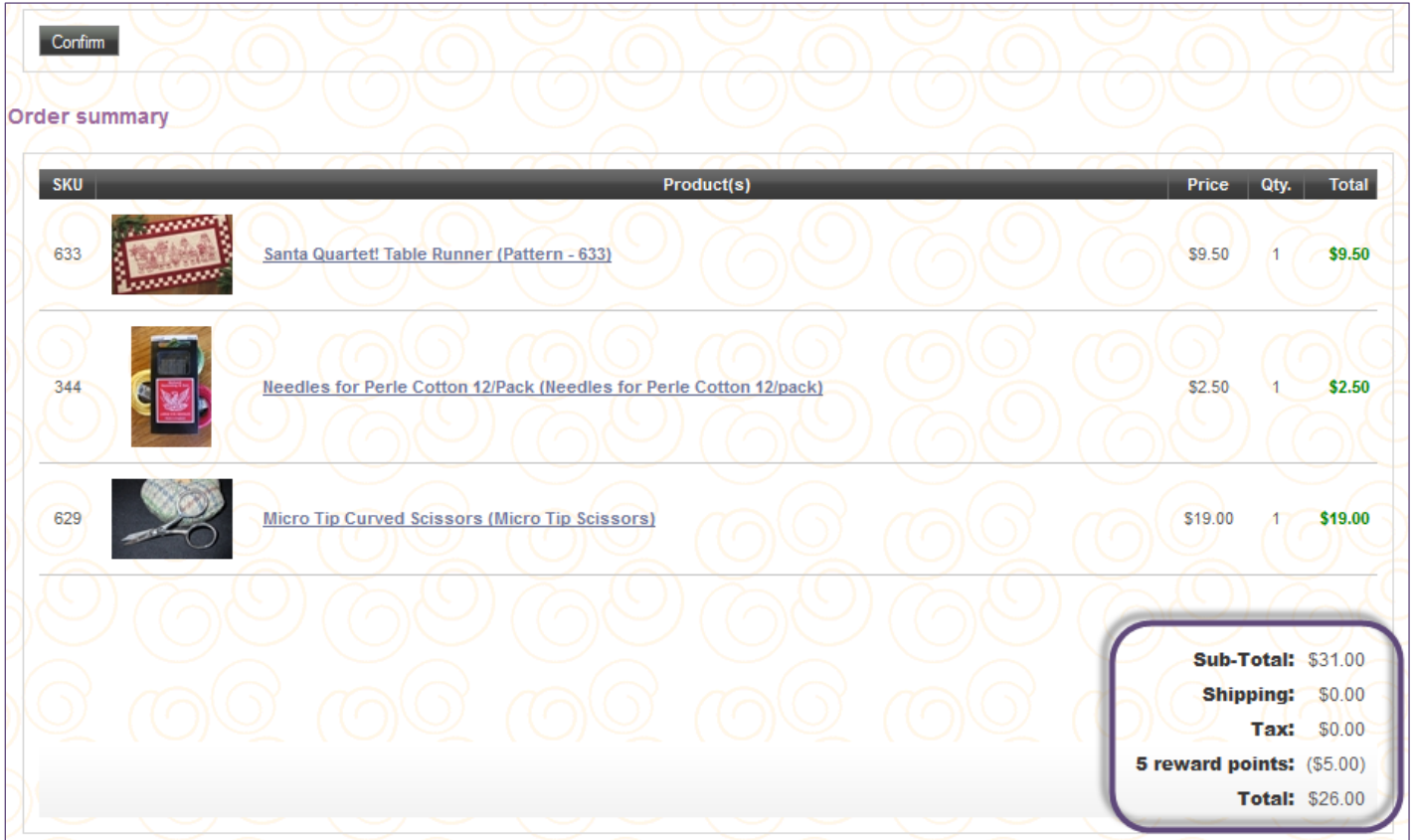
Figure 7 – Order Summary Page with Reward Points deducted from the total.

When you get to the Order Summary (the last step of the check-out), you will see that your points have been used to reduce your total by the amount of points you have. In the example in figure 7 it has reduced the order total by $5.00.